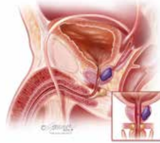
T2b Prostate Cancer