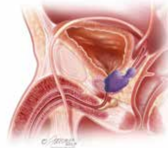
T3b Prostate Cancer