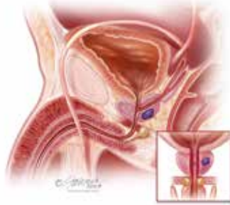
T2a Prostate Cancer