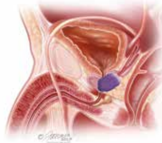
T3a Prostate Cancer