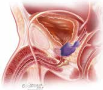
T3 Prostate Cancer