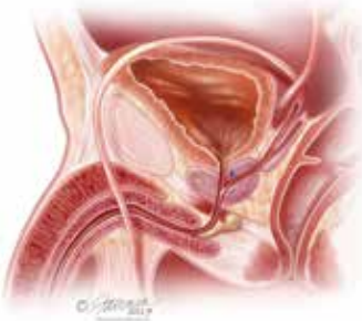
T1 Prostate Cancer